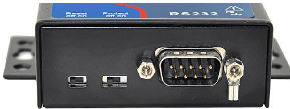
Figure 5 Port Diagram 2