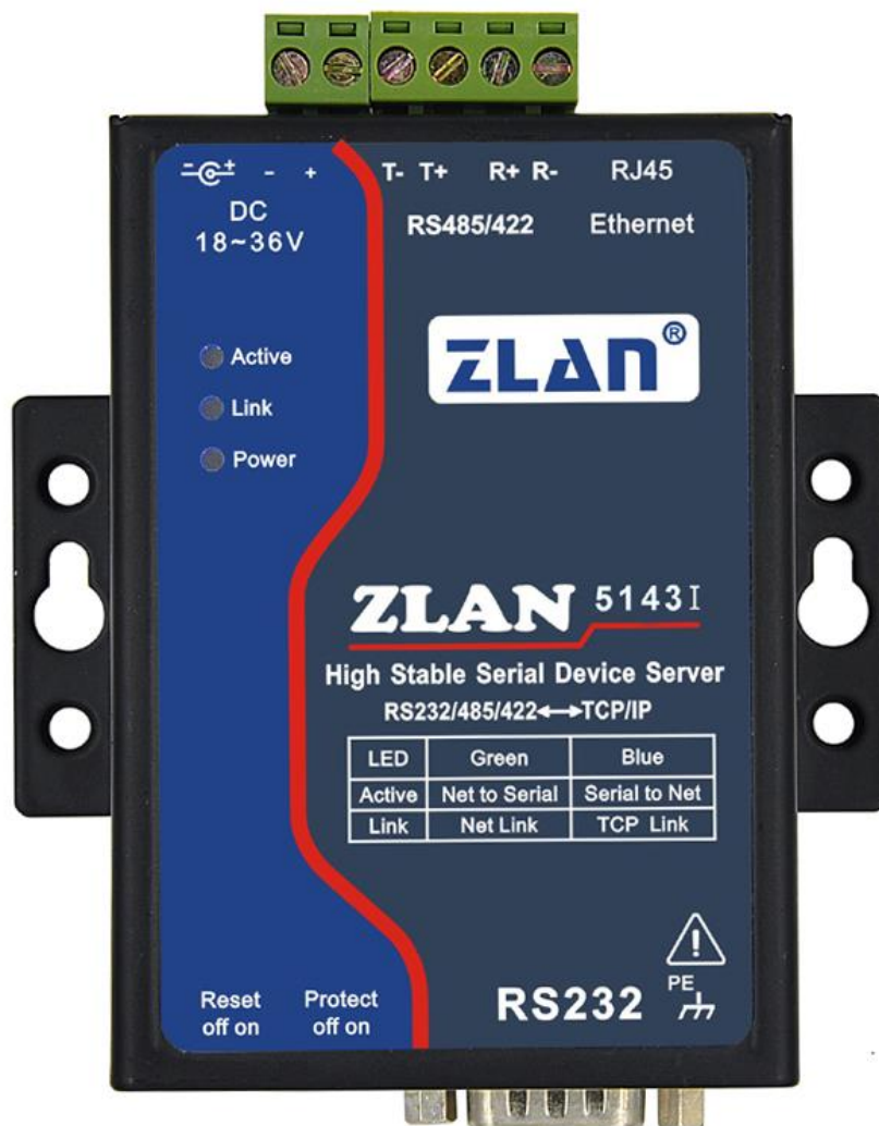
Figure 3 Front View

The front view of ZLAN5143I serial device server is shown in figure 3: ZLAN5143I use black SECC board against radiation. There are equipped with two “ear” in right and left, convenient to install. And can be equipped with guide installation accessories for convenient to be installed onto the guide rall.