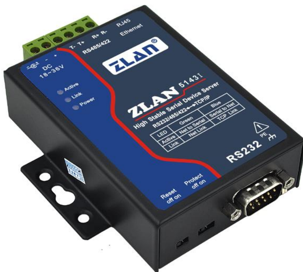
Figure 1 ZLAN5143I Isolating-type Serial Device Server

ZLAN5143I is a high reliability and high performance serial device server and Modbus Gateway product designed by Shanghai ZLAN special for lightning resistance, anti-electromagnetic interference and resisting bad environment requirements, is the flagship product on serial device server. Can be applied to industrial application requiring anti-jamming, anti-tunnel monitoring, wind power, field geological disasters monitoring and so on.