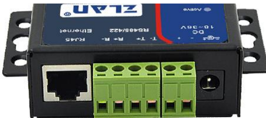
Figure 4 Port Diagram 1