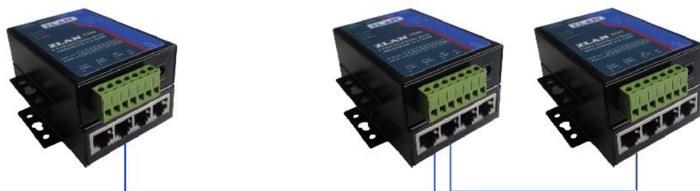
Figure 2 ZLAN5200 Cascade Approach