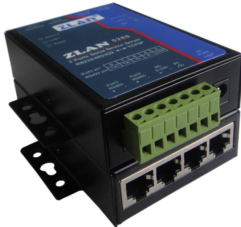
Figure 1 ZLAN5200