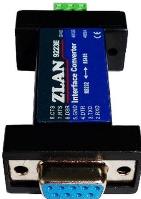
Figure 3 RS232 line sequence

Shown as figure 3, the top right corner is 1 pin, top left corner is 5 pin, down right corner is 6 pin.